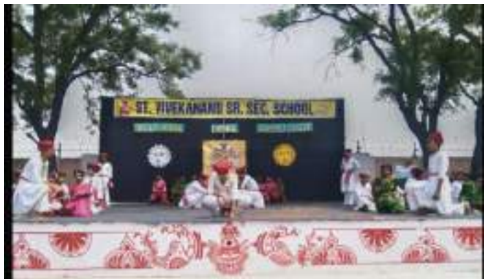
Samta House 2nd Position