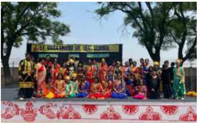
Ekta House 3rd Position