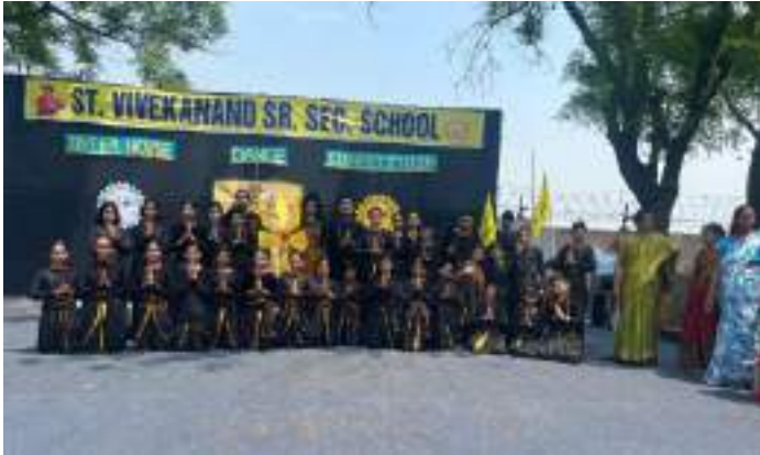
Pragya House 1st Position